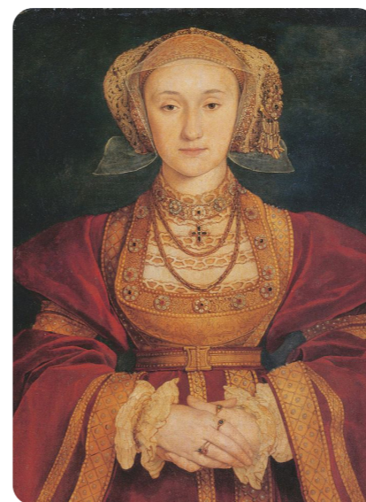
Anne of Cleves by Hans Holbein

Holbein was a German artist and portrait painter. He travelled to England in 1532 with the backing of Anne Boleyn and Thomas Cromwell. In 1535, he became the King's Painter. Holbein painted many portraits of the royal family and the nobles. He was also asked to paint a picture of Anne of Cleves so Henry could decide if he wanted to marry her. Henry liked the portrait but the marriage only lasted six months because Anne didn't look as beautiful in real life as she did in her portrait.